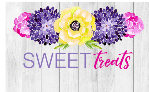
Candy Bag Topper